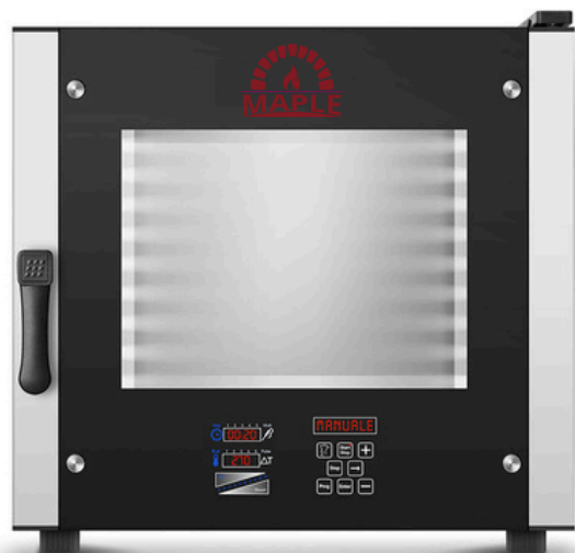
523 CE Combi Oven